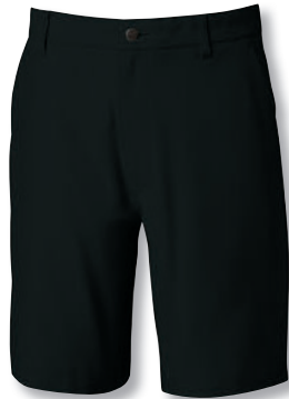
2 | 23939 Performance Lightweight Short black SRP: $85.00 logo _____