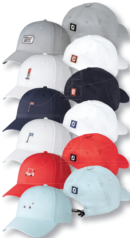
7 | 35883H* assorted