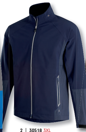
2 | 30518 3XL navy logo _____