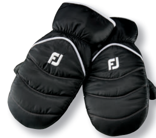
4 | 32087H black