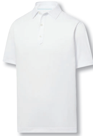
3 | 28556 Solid Lisle Set on Placket 3XL white SRP: $72.00 logo _____