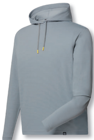
17 | 33227 Ottoman Jacquard Pullover Hoodie grey SRP: $115.00 logo _____