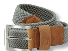
10 | 69482R Regular | 69482L Long grey