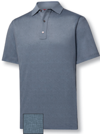
13 | 33224 Tonal Texture Print Pique flint SRP: $80.00 logo _____