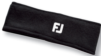
3 | 35692H black