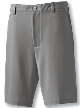
4 | 26868 Pace Short charcoal (44 Waist Available) SRP: $85.00 logo _____