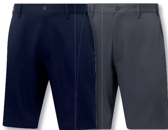
3 | 28608 navy logo _____