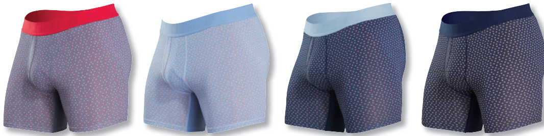
1 | 32531 flint