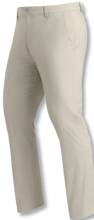
7 | 31323 Evolve Pant ivory SRP: $125.00 logo _____