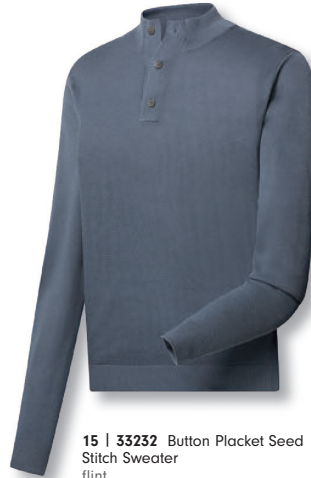
15 | 33232 Button Placket Seed Stitch Sweater flint SRP: $145.00 logo _____