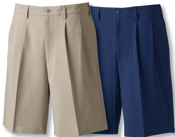
1 | 24075 khaki logo _____

On waistband for added stretch and comfort