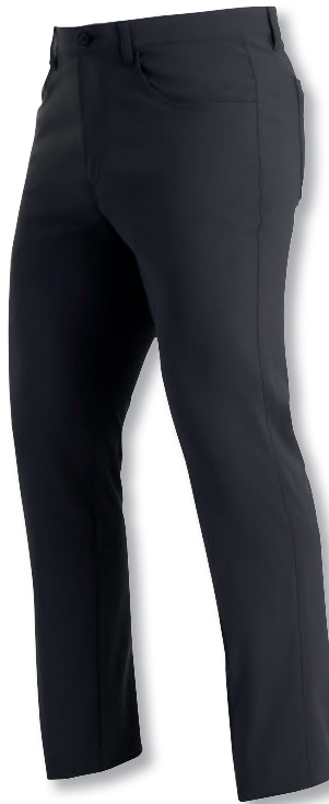
6 | 31318 Moxie 5-Pocket Pant charcoal SRP: $118.00 logo _____