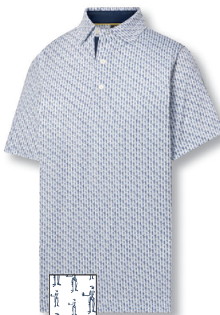
15 | 33221 Figure Print Lisle white/navy SRP: $80.00 logo _____