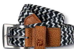
12 | 69546R Regular | 69546L Long black/charcoal/grey