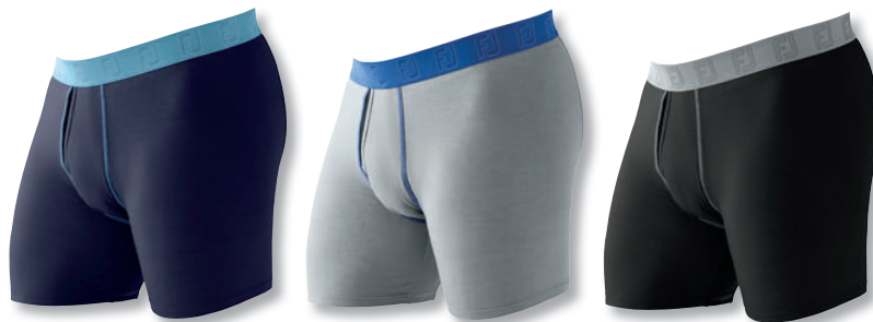
5 | 26883 navy/light blue