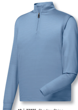
18 | 33235 Shadow Stripe Quarter-Zip Midlayer blue jay SRP: $115.00 logo _____