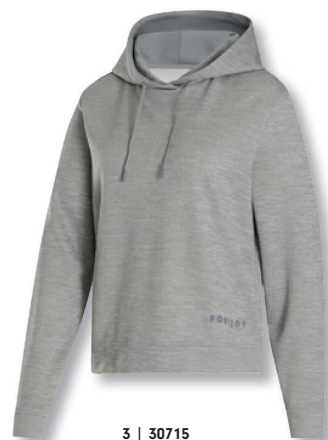
3 | 30715 heather grey logo _____