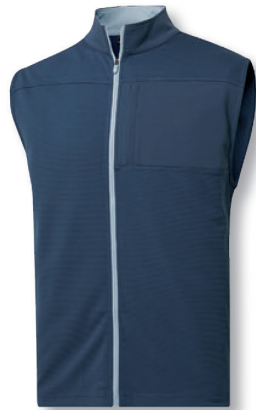
22 | 33236 Ottoman Knit Vest dark denim SRP: $115.00 logo _____