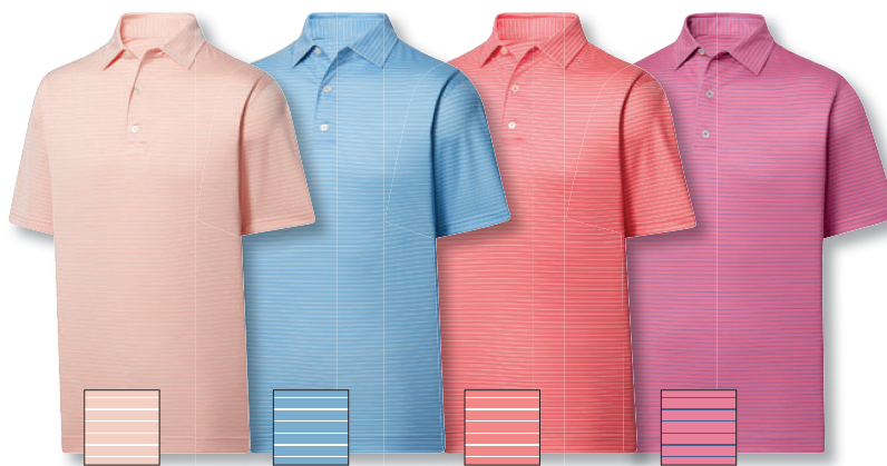
1 | 29637* quartz pink/white logo _____

Fabric: 88% polyester, 12% spandex Size: S-XXL, Select 3XL