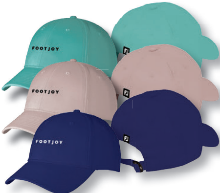
6 | 35590H spearmint/pink/navy