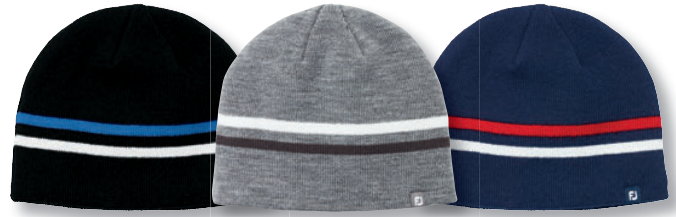
2 | 35842H* black/grey/navy