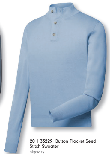
20 | 33229 Button Placket Seed Stitch Sweater skyway SRP: $145.00 logo _____