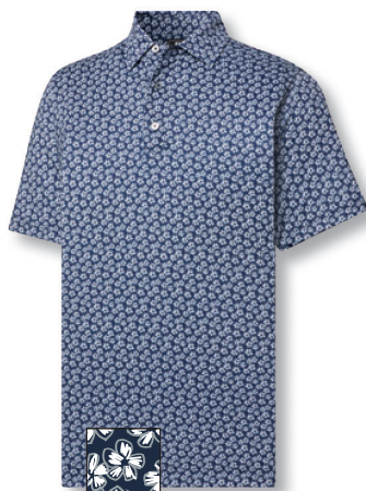
14 | 33216 Floral Sketch Print Lisle white/navy SRP: $88.00 logo _____