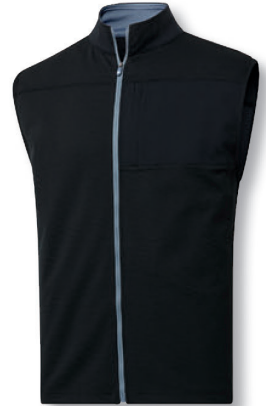
16 | 33238 Ottoman Knit Vest black SRP: $115.00 logo _____