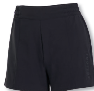
11 | 30714 black logo _____

Fabric: 87% polyester, 13% spandex Size: S-XXL