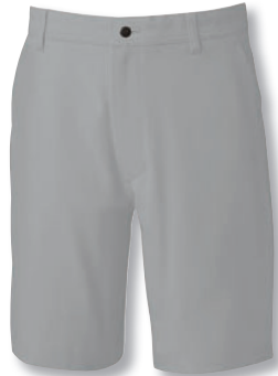
2 | 23933 Performance Lightweight Short grey SRP: $85.00 logo _____