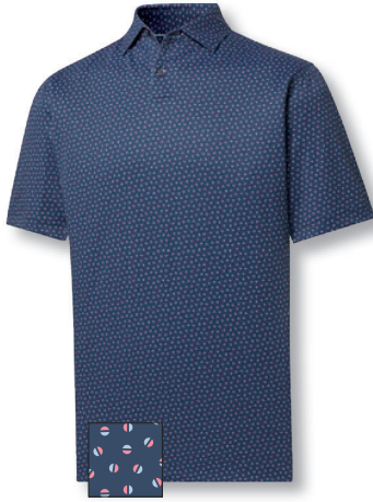
13 | 33202 Bounce Print Stretch Pique dark denim SRP: $85.00 logo _____