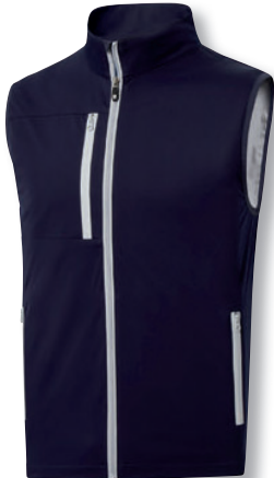
6 | 30073 FJ TempoSeries™ Lightweight Softshell Vest navy SRP: $155.00 logo _____