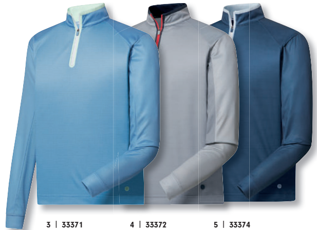
3 | 33371 blue jay logo _____

Availability: 1/10/25 | SRP: $145.00 Size: S-XXL