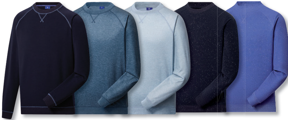
1 | 25293* navy logo _____

Fabric: 87% polyester, 8% lyocell, 5% spandex Size: S-XXL