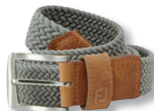
11 | 69482R Regular 69482L Long FJ Woven Belt grey SRP: $50.00