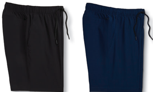
9 | 30703 black logo _____

Fabric: 87% polyester, 13% spandex Size: S-XXL