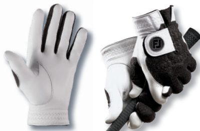
5 | 66801 Men's Regular S-XXL | 66805 Men's Cadet S-XXL pearl/grey