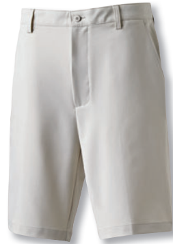
3 | 26867 Pace Short stone (44 Waist Available) SRP: $85.00 logo _____