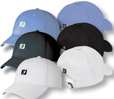
5 | 35585H blue/black/white