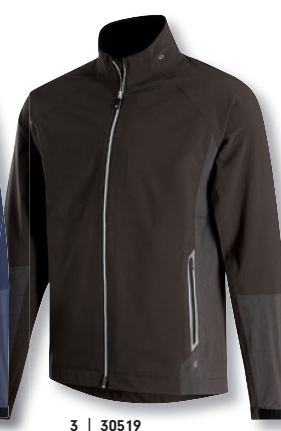
3 | 30519 black logo _____