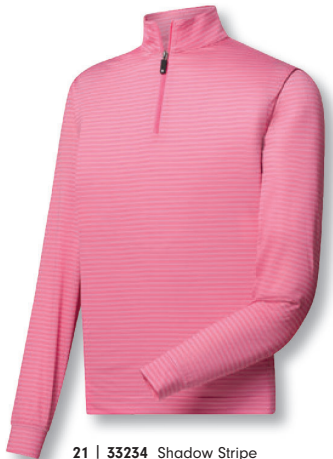
21 | 33234 Shadow Stripe Quarter-Zip Midlayer pink lemonade SRP: $115.00 logo _____