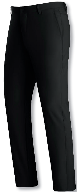
8 | 24492 Tour Fit Pant black SRP: $115.00 logo _____