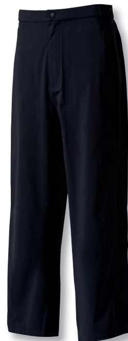
6 | 34657 3XL black logo _____