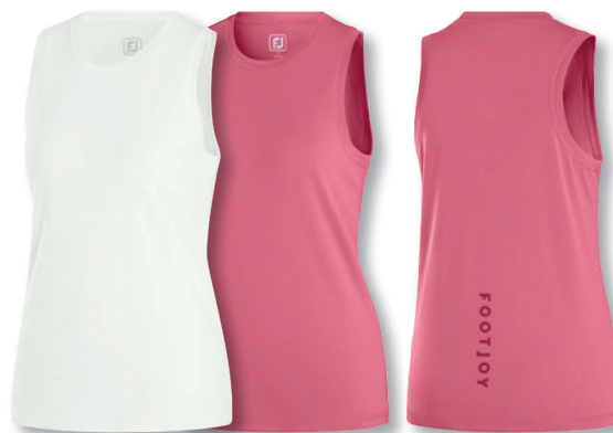
7 | 30712 white logo _____