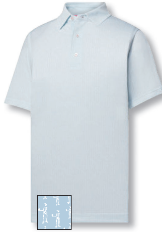
18 | 33220 Figure Print Lisle skyway/white SRP: $80.00 logo _____