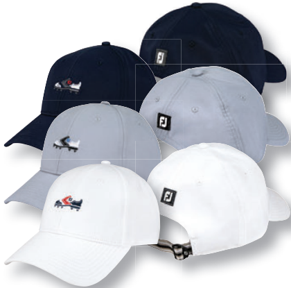
1 | 35741H* navy/grey/white