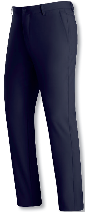
8 | 24491 Tour Fit Pant navy SRP: $115.00 logo _____