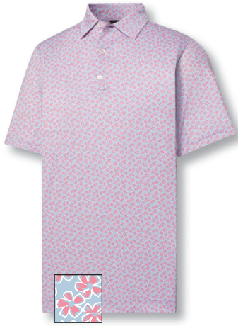
17 | 33215 Floral Sketch Print Lisle pink lemonade/skyway SRP: $88.00 logo _____