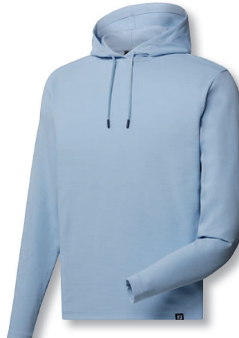
19 | 33226 Ottoman Jacquard Pullover Hoodie skyway SRP: $115.00 logo _____