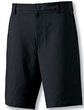
4 | 26869 Pace Short black (44 Waist Available) SRP: $85.00 logo _____