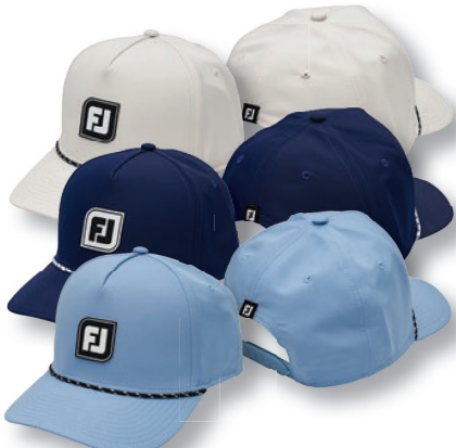
4 | 35580H stone/navy/slate