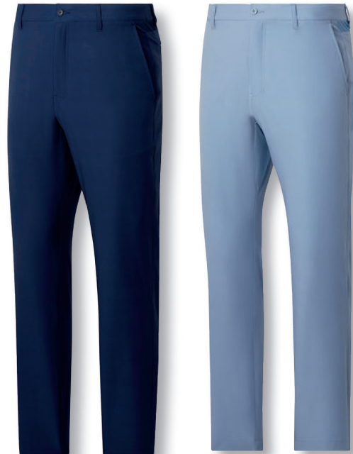
11 | 30306 navy logo _____

Waist: (30, 32, 34, 36, 38, 40, 42) Inseam: (30, 32, 34)