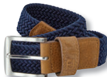
10 | 69481R Regular 69481L Long FJ Woven Belt navy SRP: $50.00