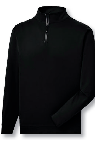
7 | 30489 Approach Quarter-Zip Pullover (Gathered Waist) 3XL black SRP: $115.00 logo _____