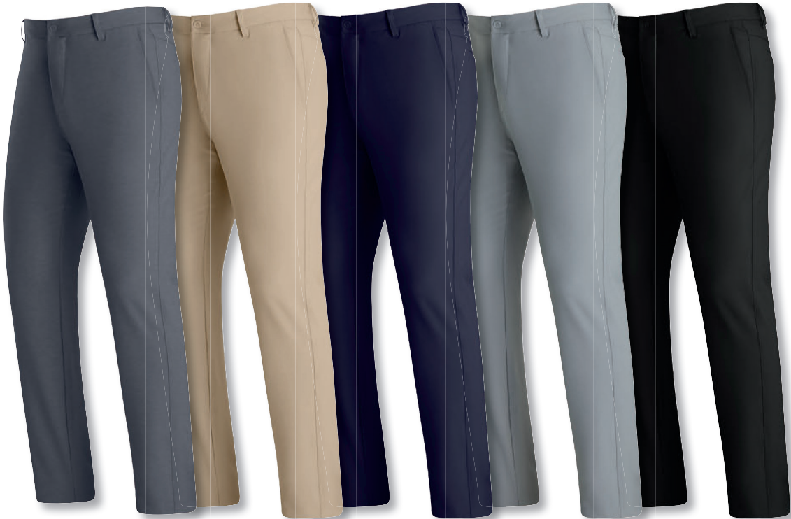
1 | 24495 heather charcoal logo _____

INSPIRED BY THE TOUR PLAYER WITH A MODERN, TAILORED FIT.