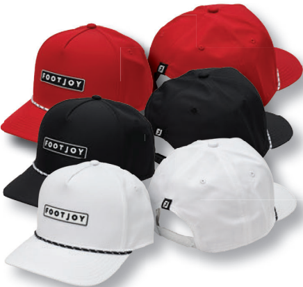
3 | 35575H red/black/white