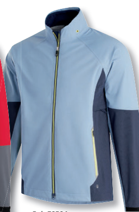
5 | 30524 slate/navy logo _____

JACKET: S (34-36), M (38-40), L (42-44), XL (46), XXL (48-50), XXXL (52-54) PANT: XS (24-26), S (28-30), M (32-34), L (36-38), XL (40-42), XXL (44-46), XXXL (48+)