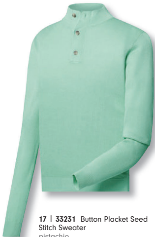
17 | 33231 Button Placket Seed Stitch Sweater pistachio SRP: $145.00 logo _____