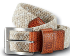
NEW 1/10/25 13 | 69567R Regular | 69567L Long khaki/stone