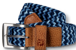
11 | 69547R Regular | 69547L Long navy tonal