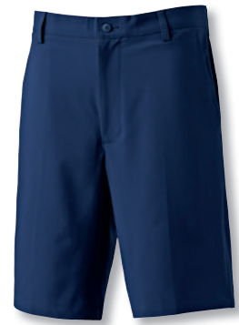
4 | 26865 Pace Short navy (44 Waist Available) SRP: $85.00 logo _____