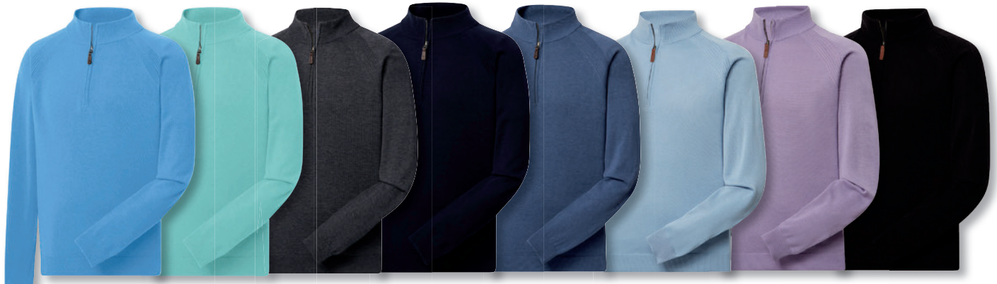
NEW 1/10/25 10 | 33306 riviera logo _____

Fabric: drirelease® 88% acrylic, 12% wool Size: S-XXL