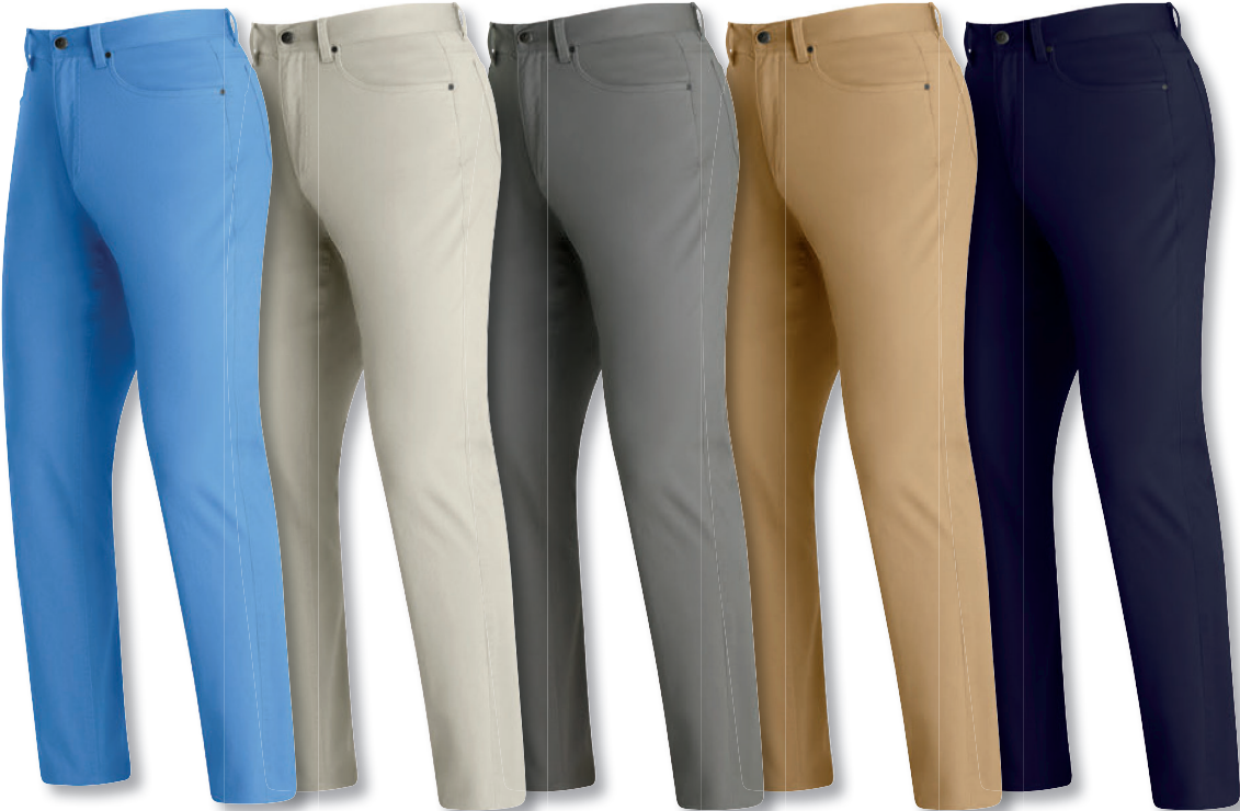
1 | 28103* lagoon logo _____

INSPIRED BY CASUAL STYLE ON AND OFF THE COURSE.