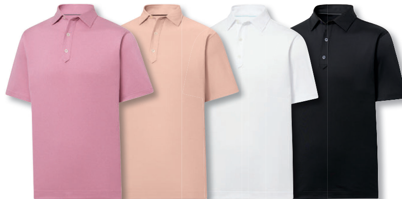
15 | 30452 heather pink logo _____