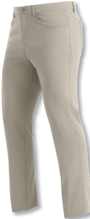
5 | 31316 Moxie 5-Pocket Pant sand SRP: $118.00 logo _____