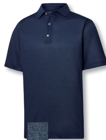
16 | 33223 Tonal Texture Print Pique navy SRP: $80.00 logo _____