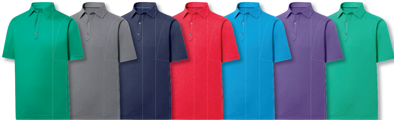
8 | 28565 3XL forest green logo _____