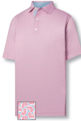
15 | 33208 Citrus Print Lisle pink lemonade/skyway SRP: $88.00 logo _____