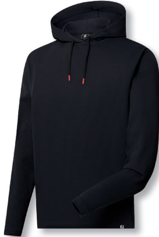
14 | 33228 Ottoman Jacquard Pullover Hoodie black SRP: $115.00 logo _____