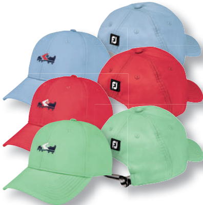
2 | 35755H* light blue/red/mint