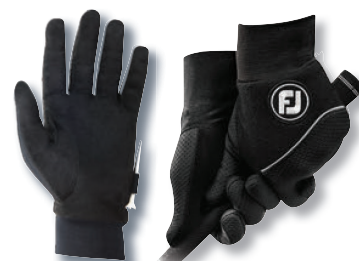
6 | 66905 Men's Regular S-XXL | 67409 Women's Regular S-L black