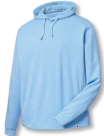
8 | 25262 Lightweight Hoodie heather sky SRP: $115.00 logo _____