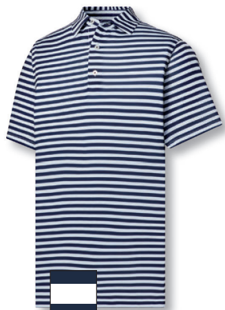
13 | 33213 Bengal Stripe Stretch Pique navy/white SRP: $85.00 logo _____