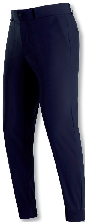
1 | 28606 navy logo _____

DESIGNED FOR THE PLAYER WHO PREFERS AN ATHLETIC LOOK AND FIT.