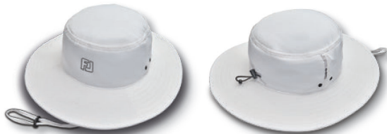
9 | 36092 S/M 10 | 36093 L/XL white