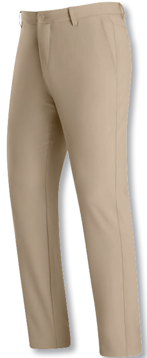
8 | 24490 Tour Fit Pant khaki SRP: $115.00 logo _____