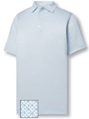
16 | 33211 Loop Print Lisle white/skyway SRP: $80.00 logo _____