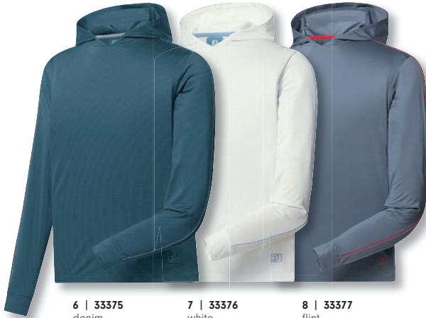
6 | 33375 denim logo _____