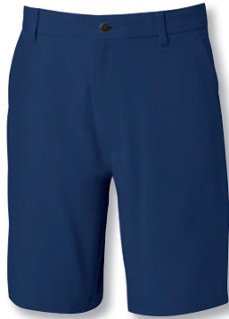
2 | 23938 Performance Lightweight Short navy SRP: $85.00 logo _____