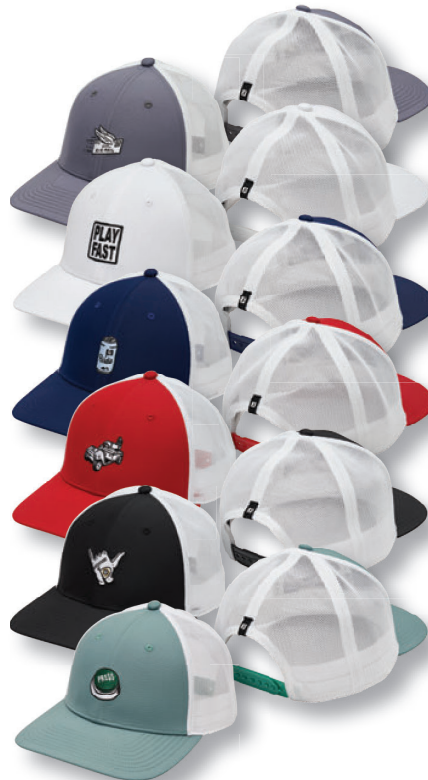
8 | 35596H assorted