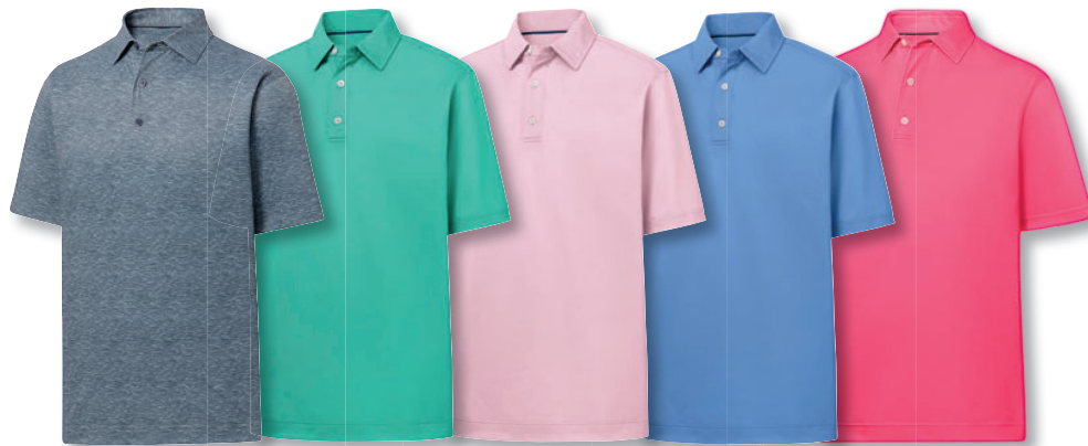
6 | 28552 3XL heather charcoal logo _____