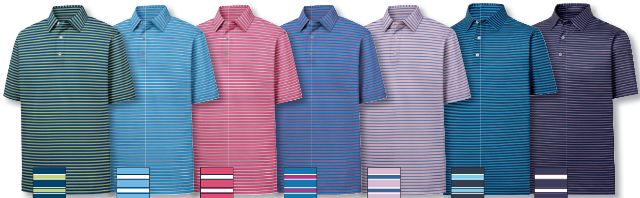
11 | 26621* navy/lime/white logo _____

Fabric: 88% polyester, 12% spandex Size: S-XXL, Select 3XL