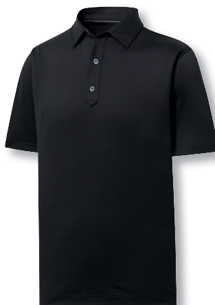
3 | 28557 Solid Lisle Set on Placket 3XL black SRP: $72.00 logo _____