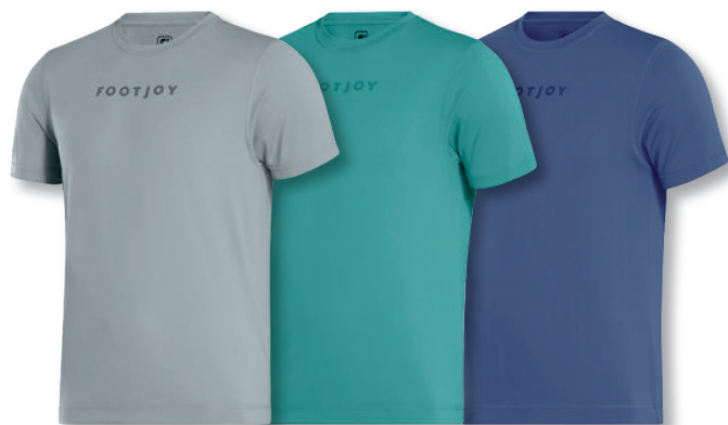
4 | 30705 grey logo _____