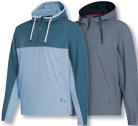
1 | 33369 denim/sky logo _____

Availability: 1/10/25 | SRP: $185.00 Size: S-XXL