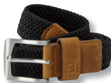
10 | 69480R Regular | 69480L Long FJ Woven Belt black SRP: $50.00