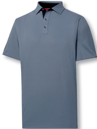
2 | 33168 Solid Pique with Trim flint/black SRP: $78.00 logo _____