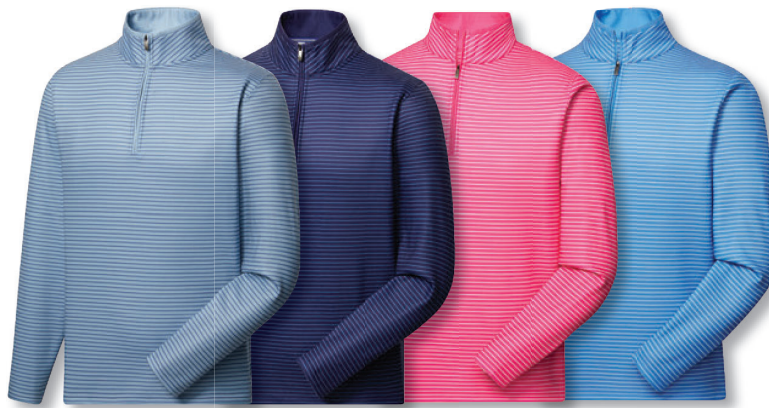
6 | 25297* river rock/storm logo _____

Fabric: 84% polyester, 11% lyocell, 5% spandex Size: S-XXL