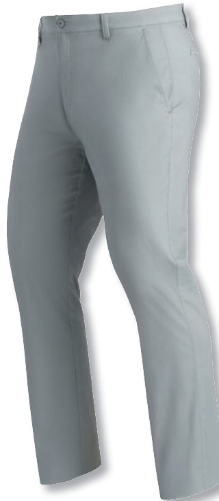
7 | 31325 Evolve Pant grey SRP: $125.00 logo _____