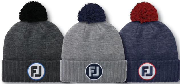
1 | 35865H charcoal/grey/navy