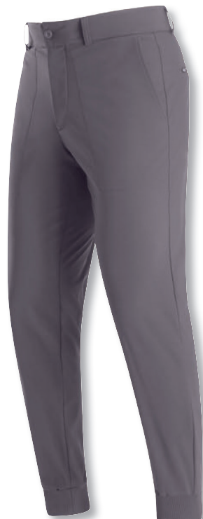
2 | 28607 lava smoke logo _____