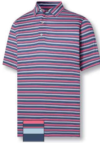
14 | 33205 Mixer Stripe Lisle dark denim/pink lemonade/skyway SRP: $85.00 logo _____