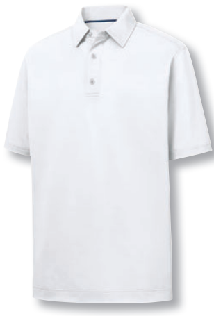
4 | 26615 Solid Stretch Pique 3XL white SRP: $72.00 logo _____