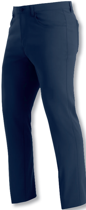
5 | 31314 Moxie 5-Pocket Pant navy SRP: $118.00 logo _____