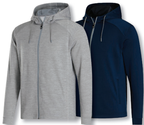
1 | 30708 heather grey logo _____