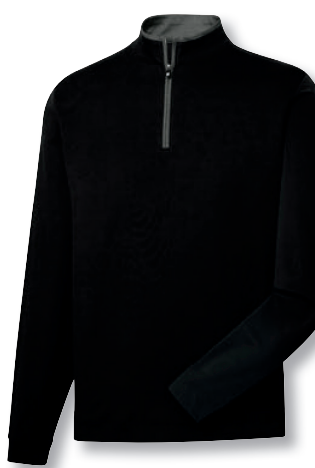
8 | 28634 Lightweight Solid Midlayer with Trim 3XL black SRP: $115.00 logo _____