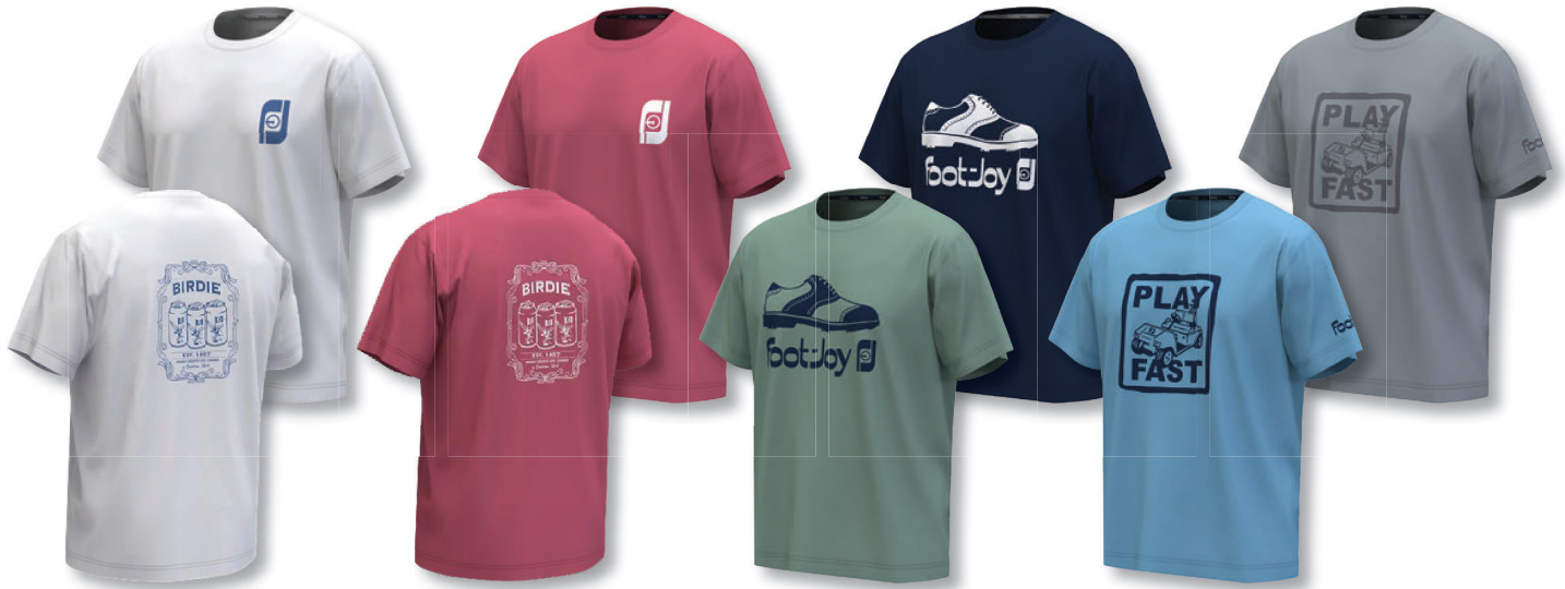
1 | 34322 Birdie Tee white

Fabric: 60% cotton, 40% polyester Size: S-XXL, Select 3XL