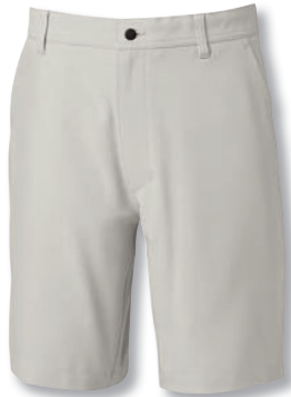
2 | 26817 Performance Lightweight Short stone SRP: $85.00 logo _____