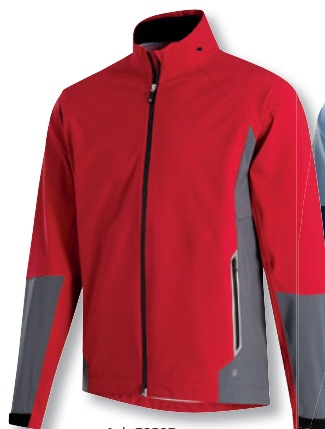
4 | 30523 dark red/charcoal logo _____