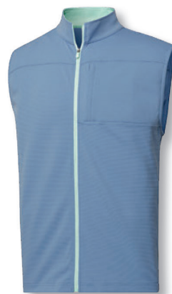
19 | 33237 Ottoman Knit Vest blue jay SRP: $115.00 logo _____