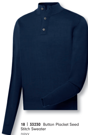
18 | 33230 Button Placket Seed Stitch Sweater navy SRP: $145.00 logo _____